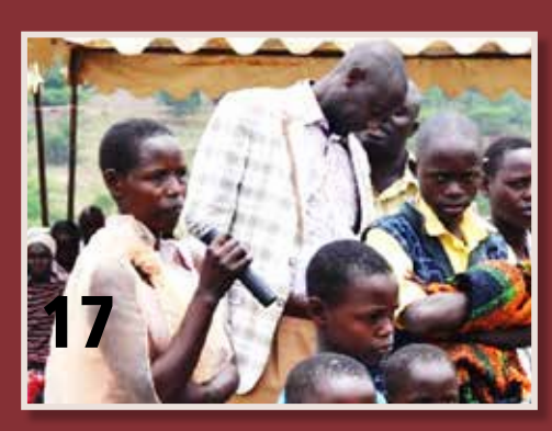
Lwengo Gets New Lease of Life through Legal Aid Project