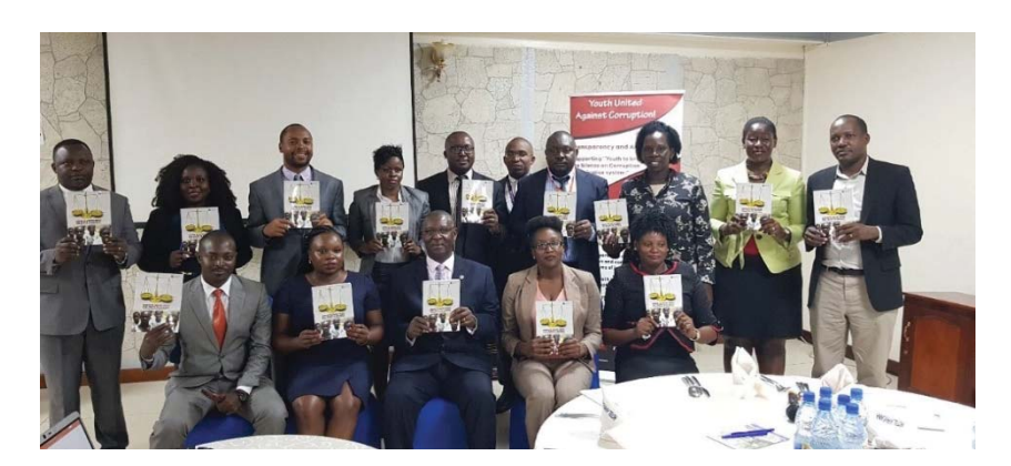
A group photo of the participants holding a copy of the launched report seated in the middle is PS Pius Brigirimana.

The report was validated on 8th November 2018 at Grand Imperial Hotel and attended by 26 participants (14 Male: 12 Female). It was further launched on 19th December 2018 by Mr. Pius Bigirimana, the then Permanent Secretary of Ministry of Gender, Labour and Social Development and attended by 74 participants (42 Male: 32 Female) including representatives from JLOS institutions, Government MDAs, youth and media.