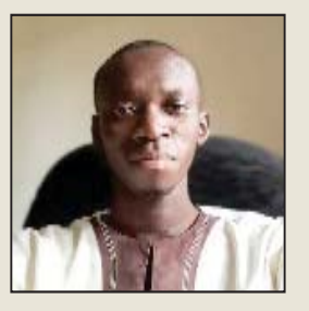
INFORMATION TECHNOLOGY OFFICER

She is responsible for maintaining and developing existing memberships and partnerships through communication and information sharing; plays a leading role in capacity development of membership as well as liaising with partners.