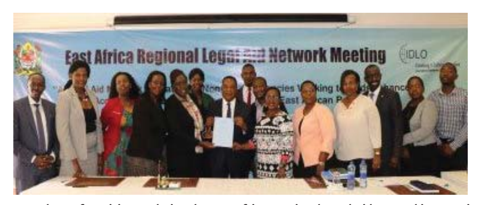
A group photo of participants during the East African Regional Legal Aid Networking Meeting.

The regional platform is aimed to strengthen coordination, cooperation and collaboration in delivery of legal id services in the region. This will be undertaken through shared advocacy initiatives for improving access to Justice in the region; sharing of good practices, undertaking research to inform practice changes, convening regional dialogues on legal aid and access to Justice among others.