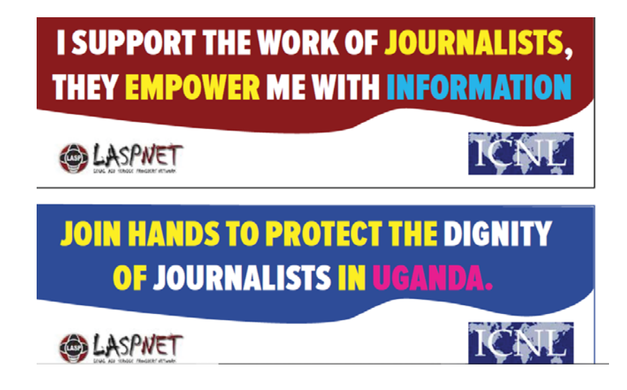
A car stiker developed under ICNL Just Speech Project

In December 2018, LASPNET with support from ICNL initiated a project titled "Just speech," aimed at promoting Freedom of Expression and Access to Information for journalists and paralegal networks. The project is implemented with other partners namely; Chapter Four and Freedom of Expression Hub. The key activities include: Training of Advocates and Journalists on Freedom of Expression and Access to Information; Publishing of commentaries on media freedom in local dailies; coordination of rapid response for journalists; coordination of the East African Regional Stakeholders Dialogue and development of IEC materials including pocket handbook, car stickers and wrist bands on Freedom of Expression.