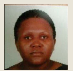
LOBBY AND ADVOCACY OFFICER

He provides financial management and administrative support to LASPNET.