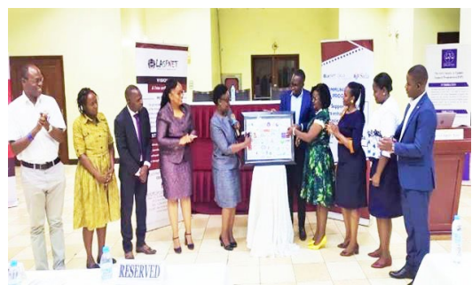
Hon. Lady Justice Eva Luswata officially launches the fundraising drive to build the Legal Aid House

Key outcome of this meeting was the launch of the fundraising dive for Legal aid service speared headed by Hon. Lady Justice Eva Luswata.