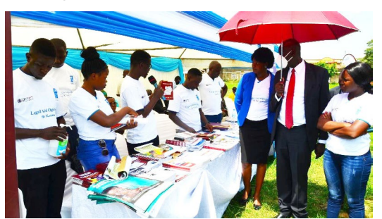
The Chief Guest inspects the exhibition table of LASPNET during the MLAC in Kasese District

Furthermore, through operationalization of the GBV toll free line, a total of 91 clients (64F, 27M) were in position to access remedy as part of the recovery mechanisms for violence.