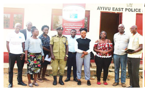
during the ASF - LASPNET Pretrial Detention Visits at Aujvu East -Police in Gulu District