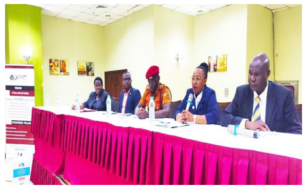
A panel discussion by representatives from Judiciary, ODPP, Police, WDHRC, and Prisons during the Coordination Forum meeting by ASF at Imperial Royale Hotel