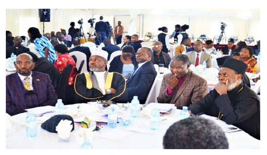
Some of the Religious leaders that graced the meeting paying attention to the proceedings.

still cannot afford a lawyer. She reiterated that LASPNET has for a long time advocated for the enactment of the NLAB through working with partners such as IDLO. Fundamentally and aware of the critical role of the religious leaders, she implored with them to utilize their various platforms to voice the need for the NLAB.