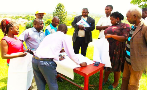
A group discussion at the joint dialogue meeting between LCs & LASPs in Kyegegegwa District