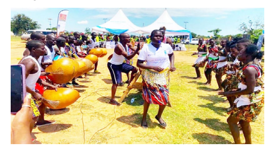
A group of dancers entertain participants during the MLAC in Kitqum District

Coordinated a series of activities in line with the commemoration of the 16 Days of Activism which among others included; A total of 10 soft copy fliers with short messages on VAWG from LASPNET staff and members were designed and disseminated across medial platforms; A total of 35 orange shirts with the theme, "UNITE! Activism to end violence against women and girls" and LASPNET, UNDP, Spotlight Initiative as well as Orange the World logos were designed and worn by LASPNET staff as they shared their call to stop GBV message as part of the campaign against GBV; and a total of five short videos featuring CEO LASPNET, Board Chair LASPNET, LASPNET Staff, clients of the UNDP project under the MLACs and people from the general public were shot and disseminated on various social media platforms. The videos contained varying messages all geared towards elimination of violence against women and girls.