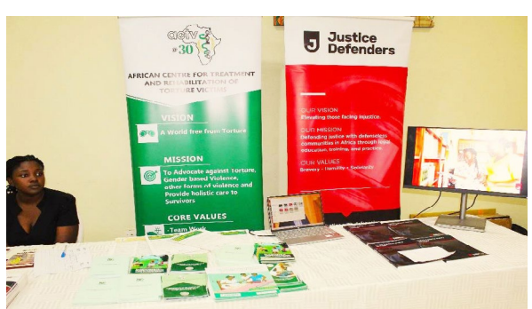
An exhibition table for ACTV and Justice Defenders during the 8th CEOs Forum