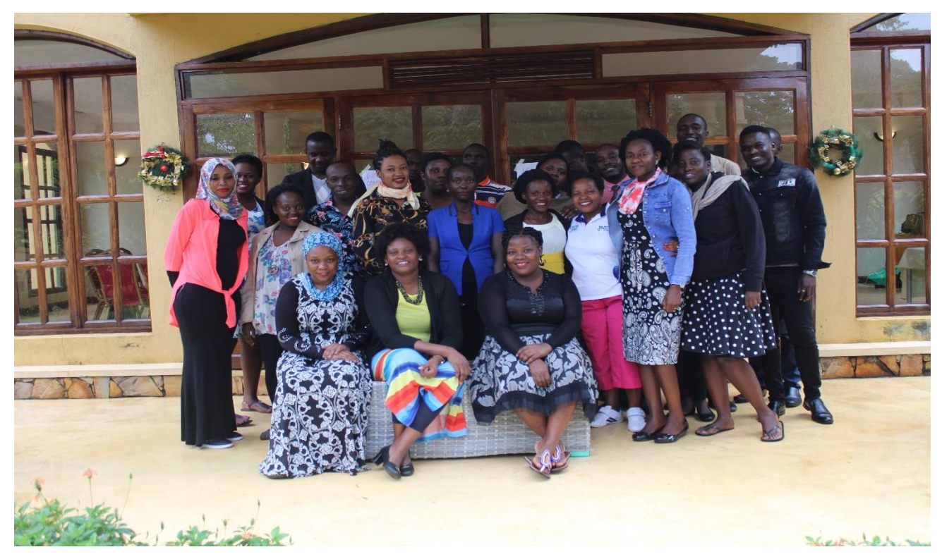
A group photo of LASPNET staff at the Retreat.

LASPNET with support from DGF held the Annual Management, Staff Review and Planning retreat from 9th to 12th December 2019 at Brovad Hotel in Kalangala. The retreat was intended to among others take stock of the year's performance including how staff had applied and used the knowledge of the previous capacity development to improve performance. During the retreat, staff were offered an opportunity to rethink working strategies to ensure effective project implementation for the year 2020.