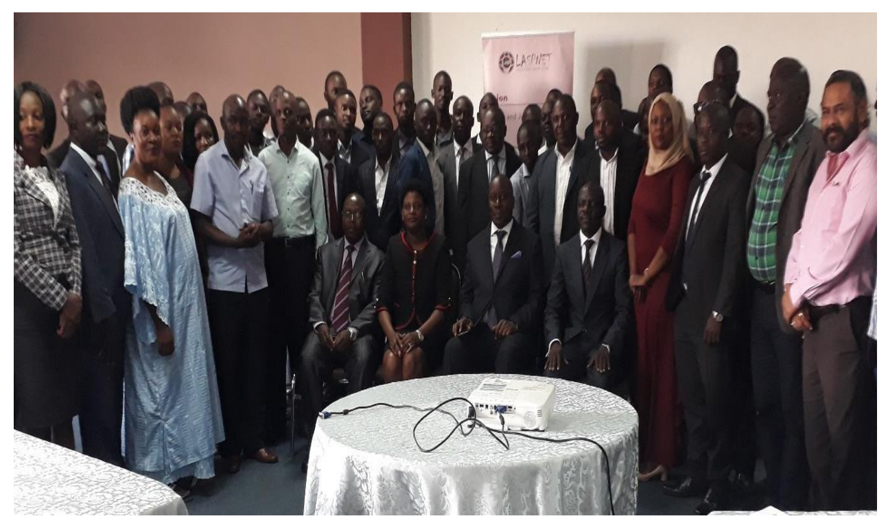
A group photo of the participants who attended the Bailiffs training at Silver Springs, Bugolobi.

At the end of the training, the participants had grasped the key concepts under execution of court orders and equipped with skills and knowledge as observed in the breakout sessions. Also key to the training was the fact that many expressed interests to join the LASPNET/UCBA probono project on execution of Court orders.