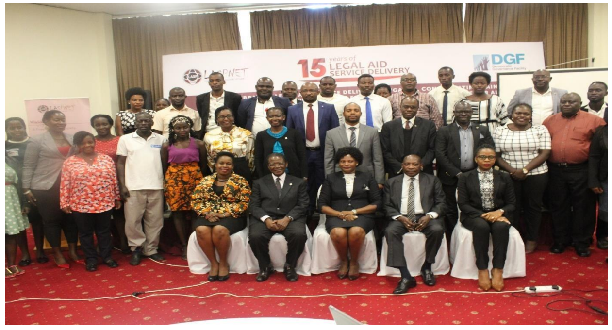
Participants pose for a group photo during the PRE-AGM Conference.

On 25th October 2019, LASPNET with support from DGF convened the 5th Annual Access to Justice Conference under the theme; "Joining efforts to fight corruption in the justice system as a Pre-requisite to enabling the poor, vulnerable and marginalized Access Justice," at Hotel Africana.