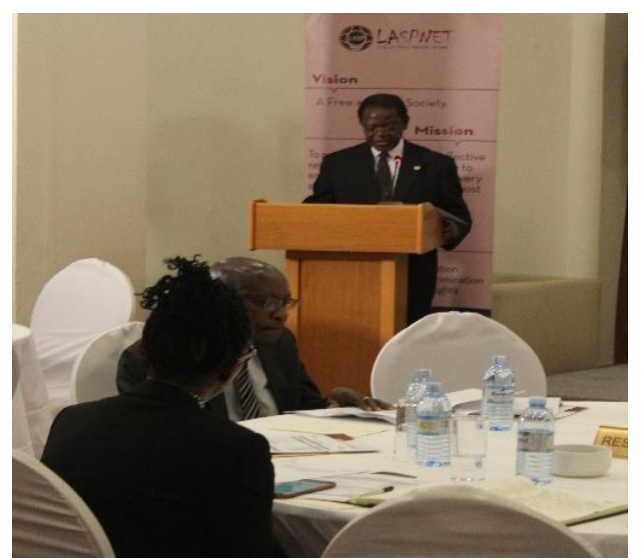
Hon. Justice Remmy Kasule giving a Key Note Address.

The Conference was officiated by the Hon. Justice Remmy Kasule, Judge of Court of Appeal who also delivered the key note address. Justice Kasule underscored the fact that corruption remains a severe impediment to the realization of Access to Justice. Noting that Justice institutions such as Police and Judiciary have not been spared by the vice.